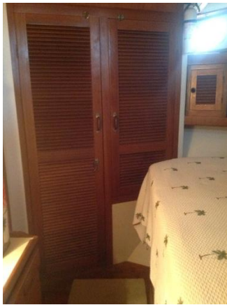
Master Stateroom Hanging Locker