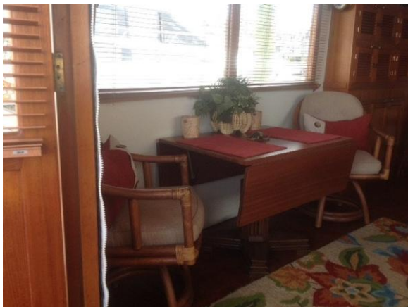
Saloon Port Side