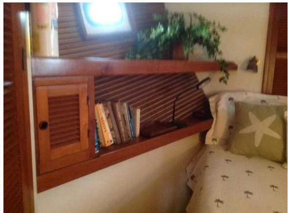
Master Stateroom Port Side