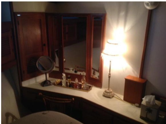
Master Stateroom Vanity