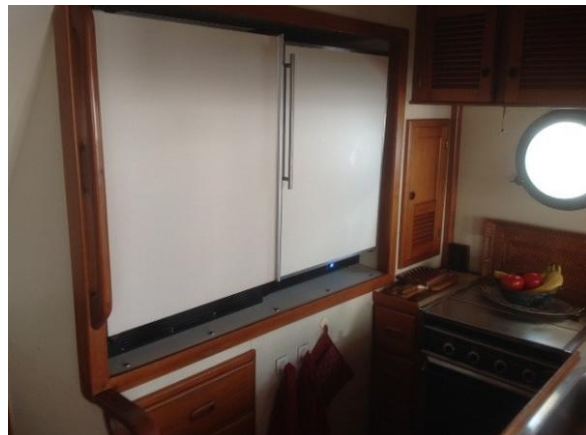
Refrigerator and Freezer