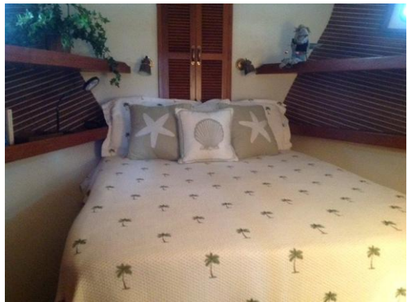
Master Stateroom Berth