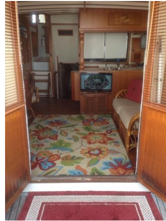
Saloon From The Aft Deck