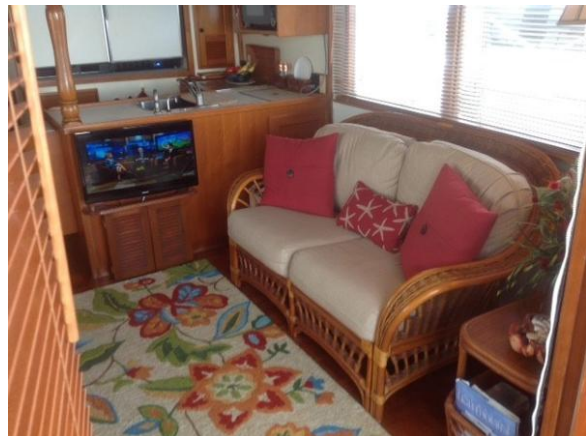
Saloon Starboard Side