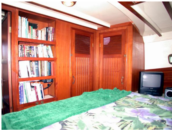
Master Stateroom 2