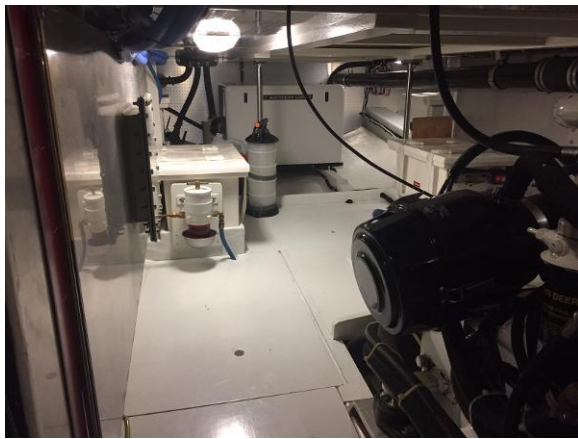
Engine Room 2