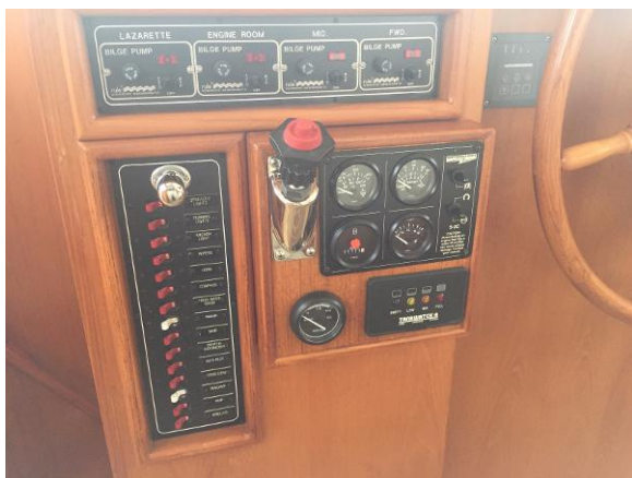
Helm Control 2