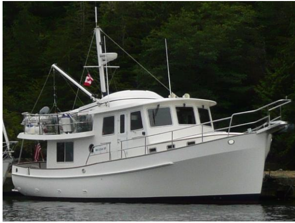
Pacific Dancer at Smith Inlet