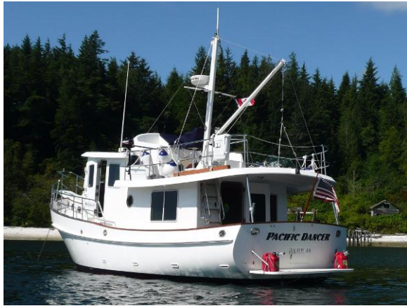
Pacific Dancer on the Hook