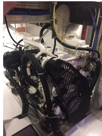
John Deere 4045