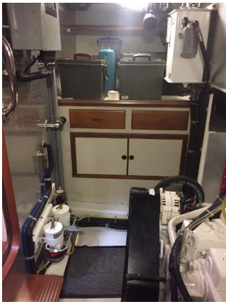
Engine Room Workbench