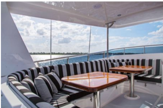
The flybridge on the Kadey-Krogen 58 EB is all about entertainment underway with seating for 10 and a "summer kitchen."

Kadey-Krogen continually evolves its designs. In its new 58 Extended Bridge, improvements include a watch berth and a day-head in the pilothouse. And her reverse-raked pilot-house says, "Take me to blue water."