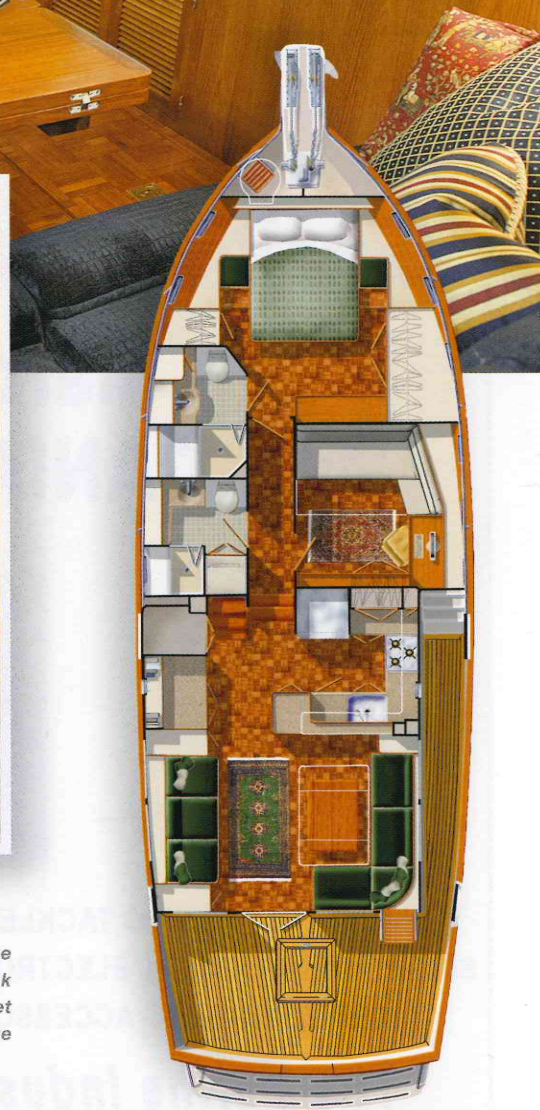
The handsome new galley arrangement above is shown in the widebody version of the layout (right). The pilothouse and flybridge are the same on both models. A traditional teak interior includes a standard parquet floor. The image at top shows the handy buffet cabinet on port opposite the galley. On Hull No. 48, the TV cabinet no longer exists, creating a large pantry-style cabinet with pull-out drawers on the galley side.

I was recently aboard North Sea Hull No. 48, the second of the new breed and first to be delivered to the East Coast. Built for Will and Sue Parry, it's their fifth Kadey-Krogen. So what are the differences? So subtle that you can't see them from the dock, yet for serious cruisers—or live-boarders like the Seattle-based owners of Hull No. 47—they are likely game changers, especially the galley.