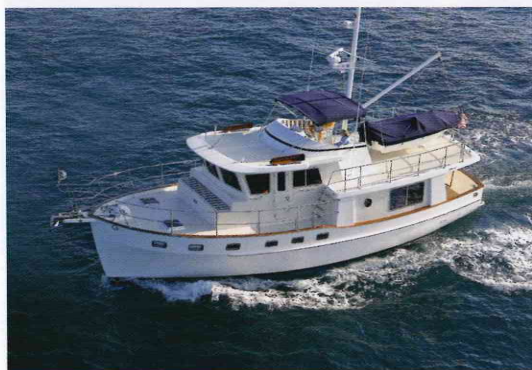
The wide-body model still has access from the pilothouse to the foredeck on the port side. Below, the new flybridge seating and dining area.

The next big change is the completely re-engineered flybridge. What you'll notice is that instead of a centerline helm flanked by settees running fore and aft, the flybridge helm (with enough room for two helm chairs) is now off to starboard with an L-shaped settee and table to port that extends the entertainment space of the boat and makes cruising on the flybridge more congenial. The flybridge also has a summer kitchen aft of the helm area with a grill and refrigeration. This feature certainly extends the livability of the upper deck for owners who entertain on the hook or want more living space than the covered aft main deck affords. What you won't notice is that this new flybridge is made up of less component parts. Reducing the number of molds