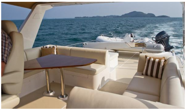
Flybridge and Boatdeck - Sistership Photo