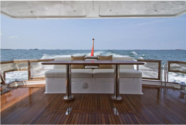
Aft Cockpit - Sistership Photo