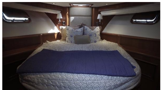
Island Queen VIP