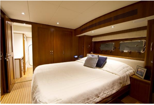
Master Cabin - Sistership Photo