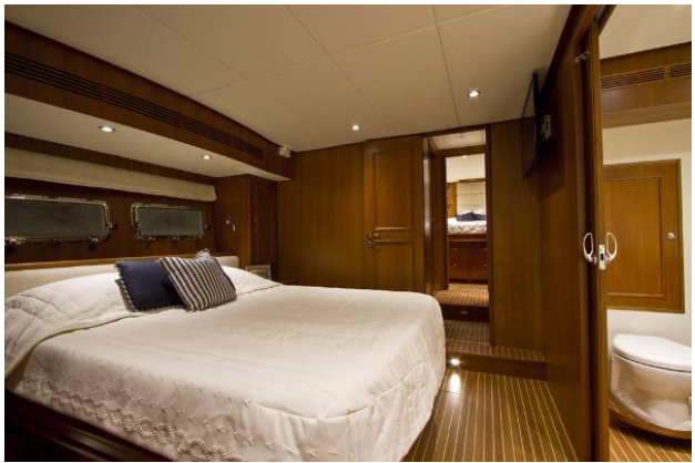
Master Looking fwd - Sistership Photo