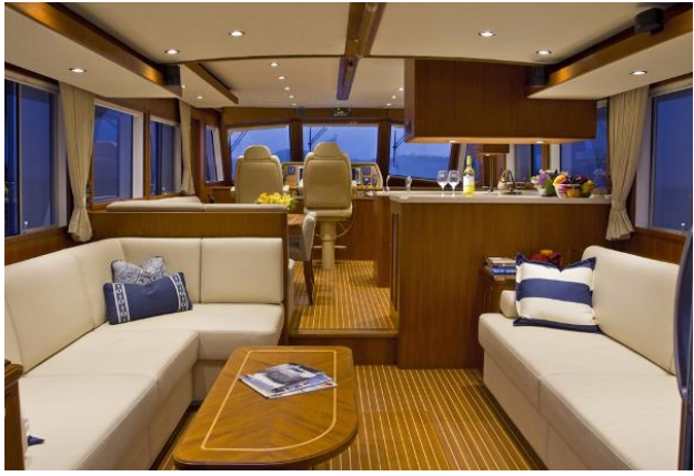
Salon/Galley/Pilothouse - Sistership Photo