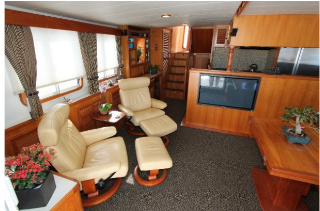
Saloon Port Side