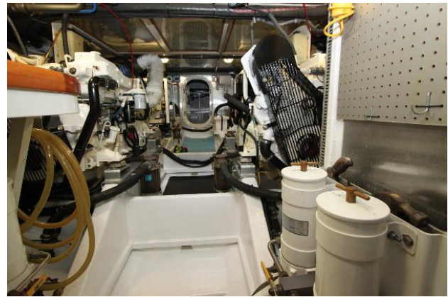
Engine Room Looking Aft