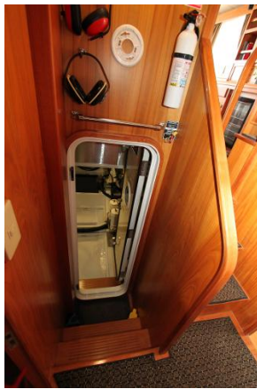
Engine Room Entrance