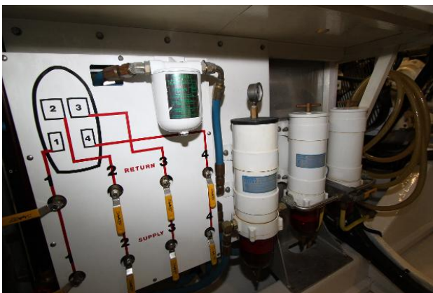
ESI Fuel Polishing System