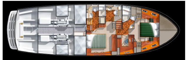
G A Rendering