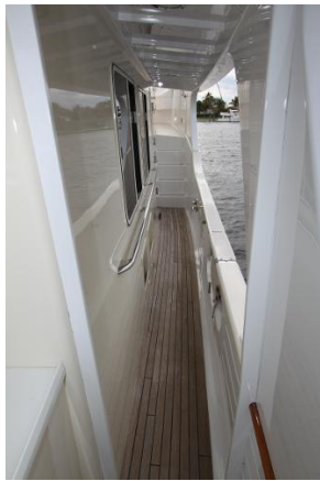
Starboard Side Deck