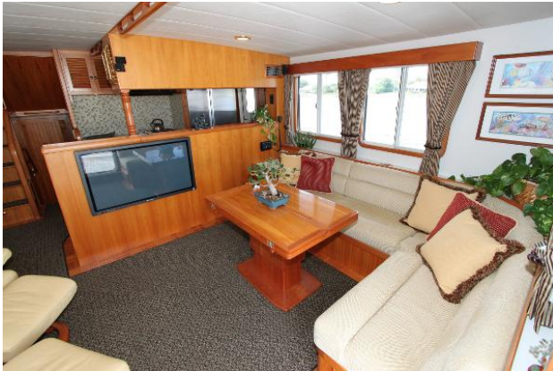
Saloon Starboard Side