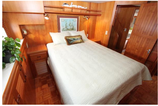
Mid-Ship Master Stateroom