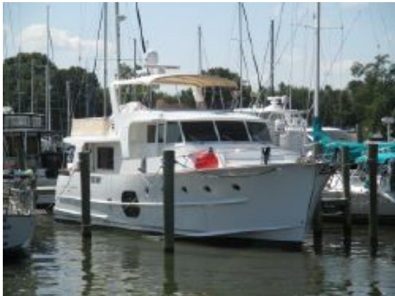
> Beneteau Swift 52 - In her Slip