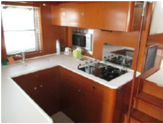
> Beneteau Swift 52 - Galley