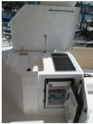
> Beneteau Swift 52 - Flybridge Sink, Fridge and Grill