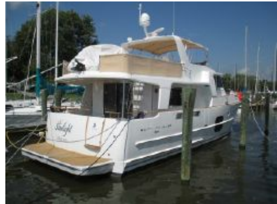
> Beneteau Swift 52 - Stern Quarter