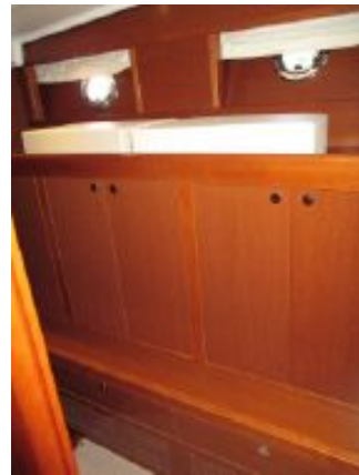
> Beneteau Swift 52 - Walk-in Closet and Storage Room