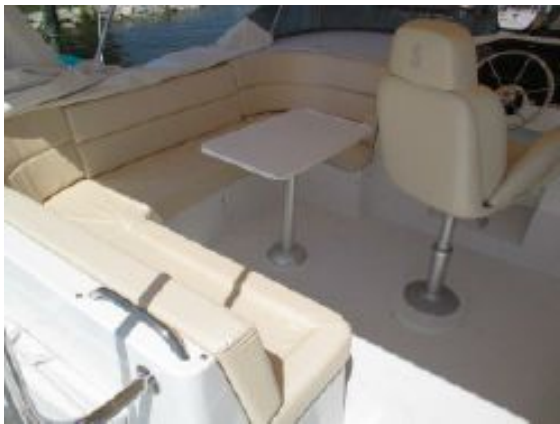
> Beneteau Swift 52 - Flybridge Helm and Seating