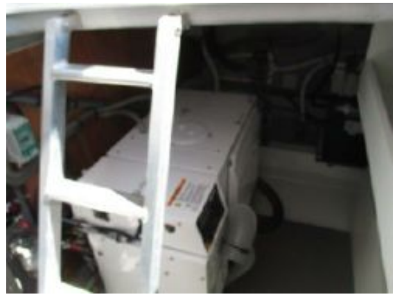
> Beneteau Swift 52 - Aft Cockpit Genset