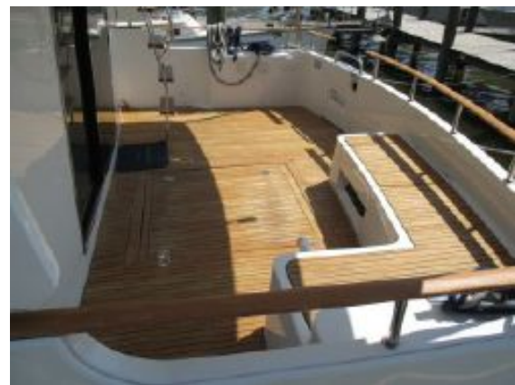
> Beneteau Swift 52 - Aft Cockpit