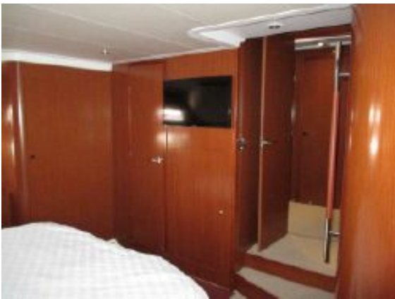
> Beneteau Swift 52 - Owner's Cabin TV