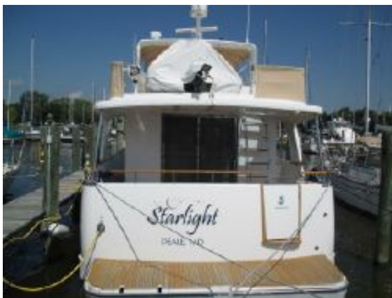
> Beneteau Swift 52 - Stern