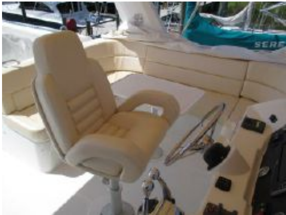
> Beneteau Swift 52 - Flybridge Helm Chair