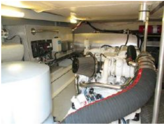
> Beneteau Swift 52 - Engine Room to Port