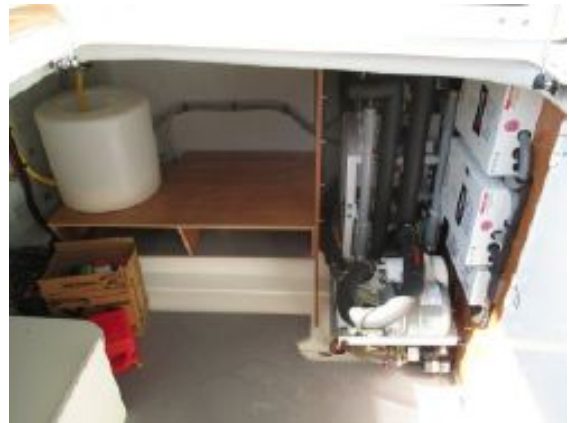
> Beneteau Swift 52 - Foredeck Seating Storage