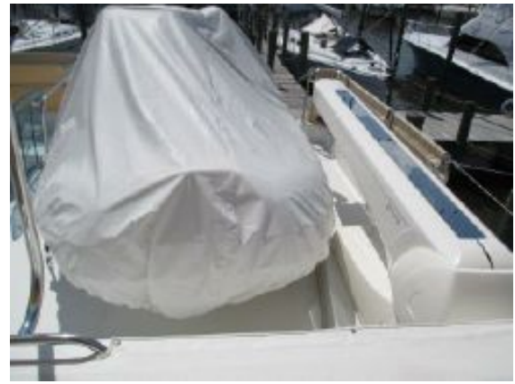
> Beneteau Swift 52 - Flybridge Dinghy and Crane