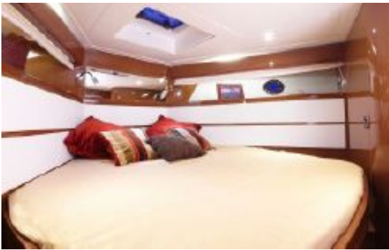
> Beneteau Swift 52 - Forward VIP Guest Stateroom with centerline Berth