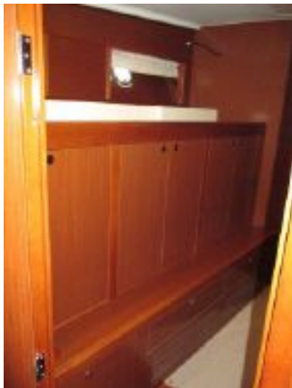
> Beneteau Swift 52 - Walk-in Closet and Storage Room