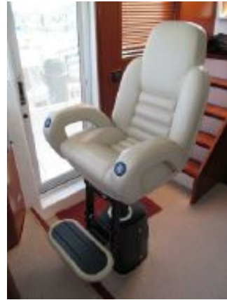
> Beneteau Swift 52 - Inside Helm Chair