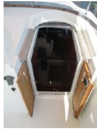
> Beneteau Swift 52 - Flybridge Sink, Fridge and Grill