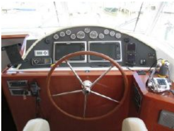
> Beneteau Swift 52 - Inside Steering Station