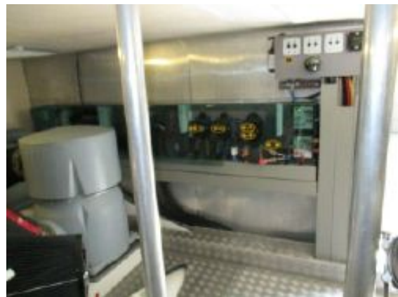
> Beneteau Swift 52 - Engine Room