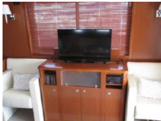
> Beneteau Swift 52 - Main Salon Pop-up TV