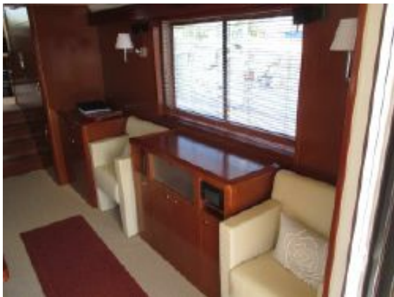
> Beneteau Swift 52 - Main Salon Additional Seating and Storage