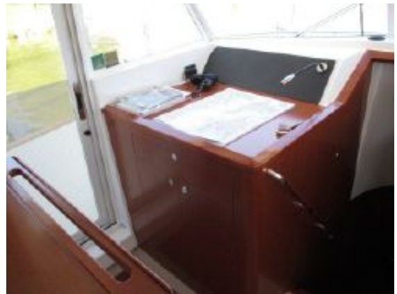
> Beneteau Swift 52 - Map Desk