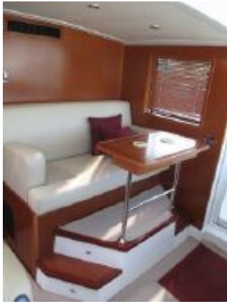
> Beneteau Swift 52 - Forward Facing Steering area Lounge