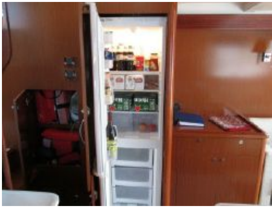
> Beneteau Swift 52 - Fridge