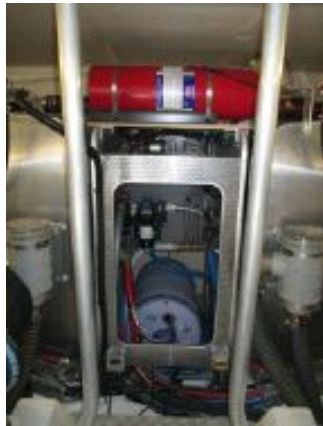
> Beneteau Swift 52 - Engine Room - Hot water heater and Fire Suppression