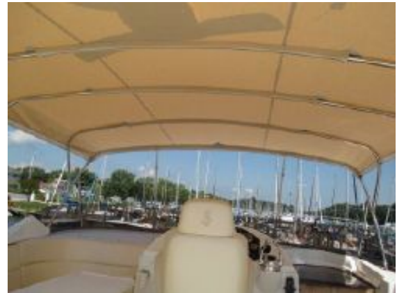
> Beneteau Swift 52 - Bimini