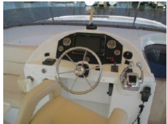
> Beneteau Swift 52 - Flybridge Instrumentation