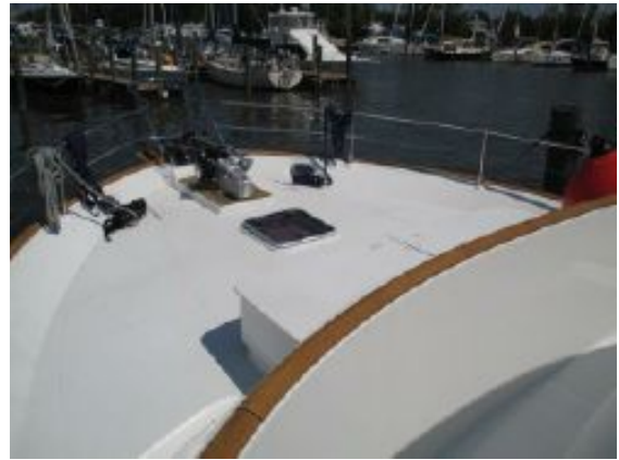
> Beneteau Swift 52 - Walkway Storage