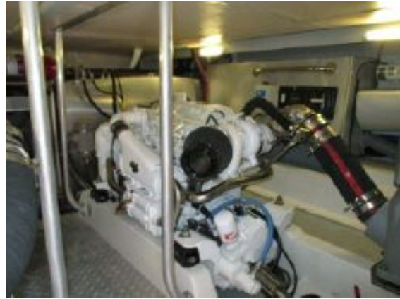
> Beneteau Swift 52 - Engine Room to Starboard