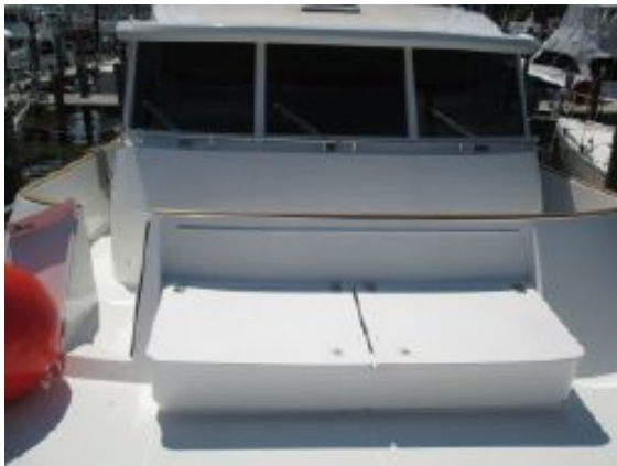
> Beneteau Swift 52 - Bridge Access Door