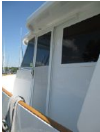
> Beneteau Swift 52 - Port Walkway