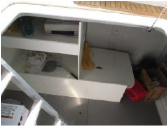
> Beneteau Swift 52 - Aft Cockpit Storage Area