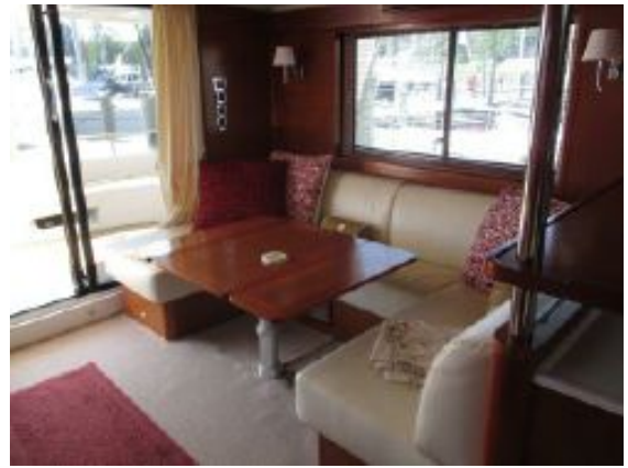
> Beneteau Swift 52 - Main Salon Looking Aft