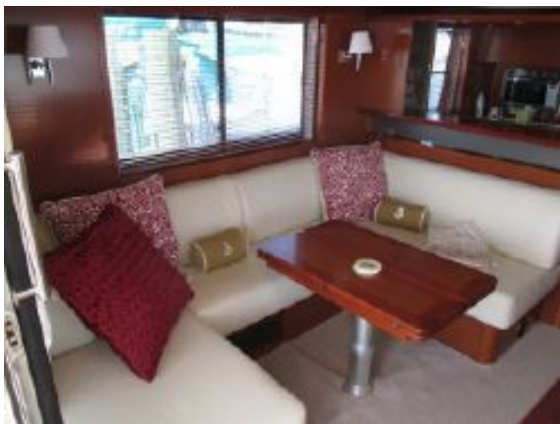
> Beneteau Swift 52 - Main Salon Seating