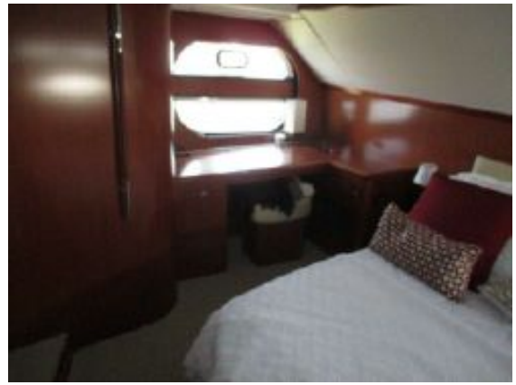
> Beneteau Swift 52 - Owner's Cabin to Starboard