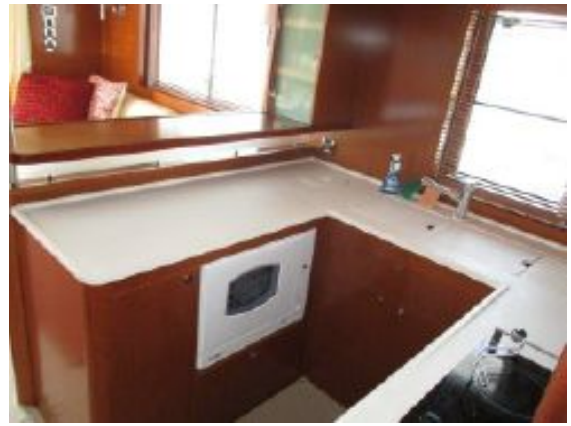
> Beneteau Swift 52 - Galley Counter