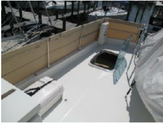
> Beneteau Swift 52 - Flybridge Rear Access