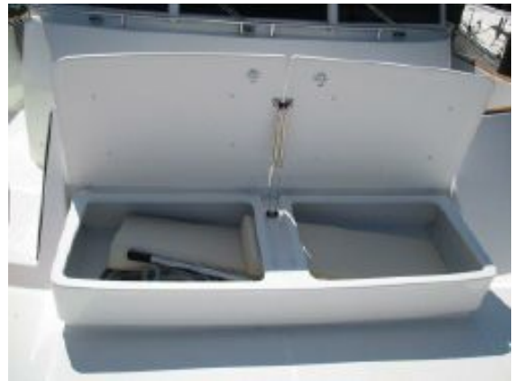
> Beneteau Swift 52 - Foredeck