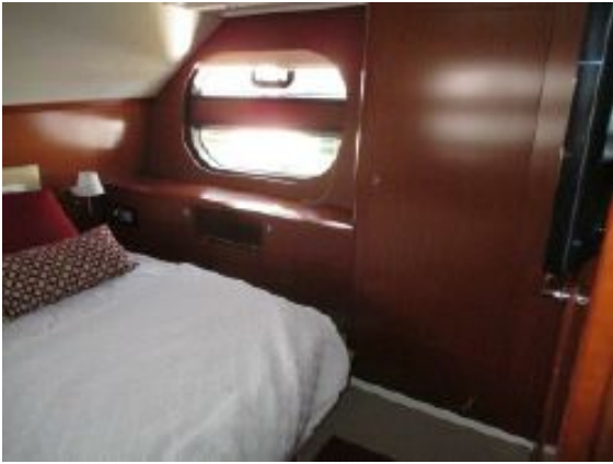
> Beneteau Swift 52 - Owner's Cabin to Port