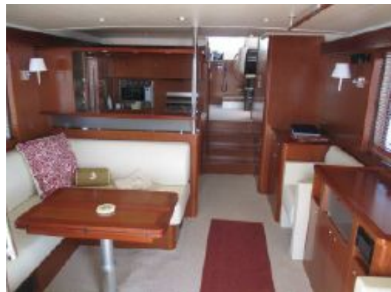
> Beneteau Swift 52 - Main Salon Looking Forward