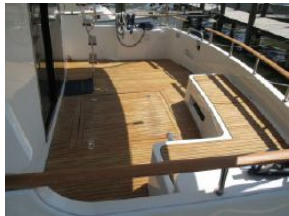
> Beneteau Swift 52 - Aft Cockpit