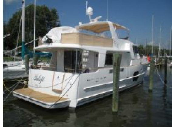
> Beneteau Swift 52 - Stern Quarter