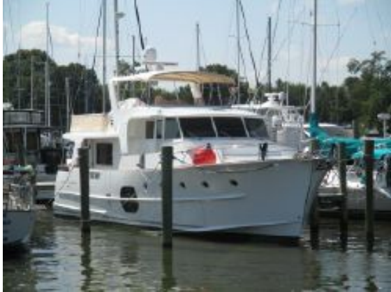
> Beneteau Swift 52 - In her Slip